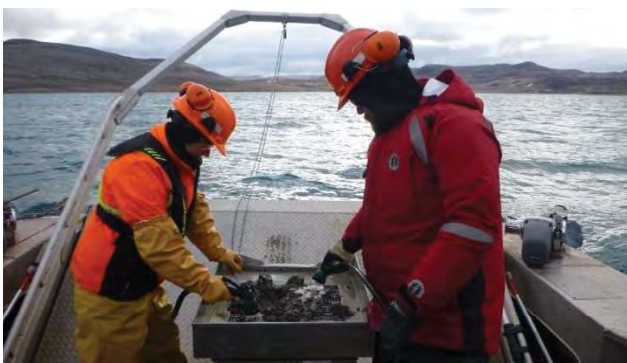
Marine Environmental Effects and Aquatic Invasive Species and Habitat Offset

Investigates narwhal response to shipping along the Northern Shipping Route by observing them from the top of Bruce Head.