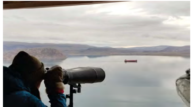
Bruce Head Shore-based Monitoring

Monitors ringed seal density and distribution during spring, and narwhal abundance and distribution and other marine mammal species in Project area throughout the summer.