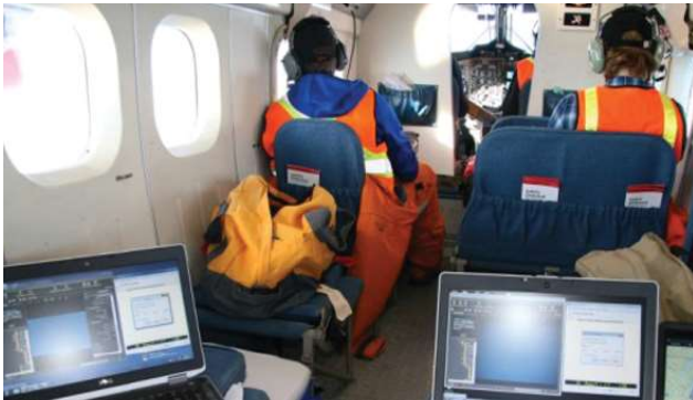
Marine Mammal Aerial Surveys

***Ship-based Observer Program is not possible in 2021 due to the COVID-19 Pandemic. However, as an alternative, an incidental marine wildlife sighting program is being implemented in collaboration with the Marine Mammal Observation Network (MMON) with a subset of participating vessels.***