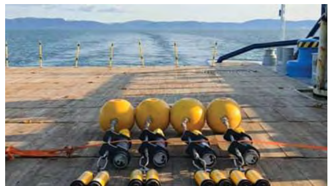
Passive Acoustic Monitoring

Implementing Year 2 of 10 year Freight Dock post-construction habitat offset monitoring program to assess functionality.